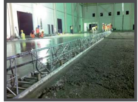
HIGH OUTPUT WITH UP TO 75M 3 OF CONCRETE LAID PER HOUR