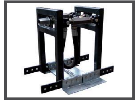
ADJUSTABLE CROWN OR INVERT BRACKET